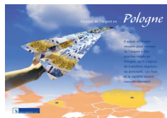
Envoyer de l'argent en Pologne