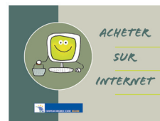
Acheter sur Internet