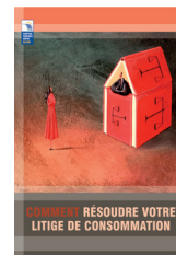
Comment résoudre votre litige de consommation