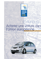
Acheter une voiture dans l'Union européenne