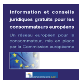
Feuille d'information sur le Centre Européen des Consommateurs