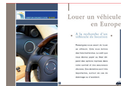
Louer un véhicule en Europe