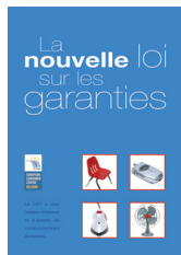
La nouvelle loi sur les garanties

More ECC Belgium publications. They can be ordered free of charge or downloaded from www.eccbelgium.be