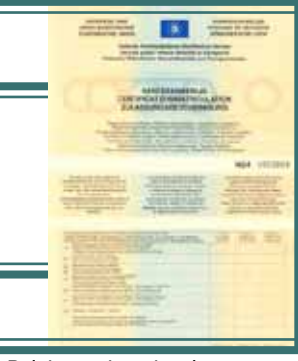
Belgian registration document (new)

For second-hand cars the 705 vignette is supplied without having to pay VAT in Belgium.